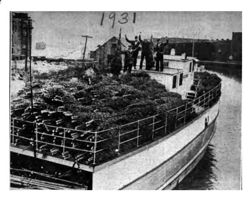
The North Shore is docking in 1931 at the Kinnickinnic Bridge with a load of 6,500 trees.

Previously published in Bay View Compass newspaper.